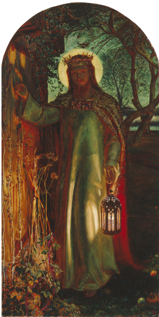
"The Light of the World," William Holman Hunt, 1851-56, Manchester City Art Gallery.