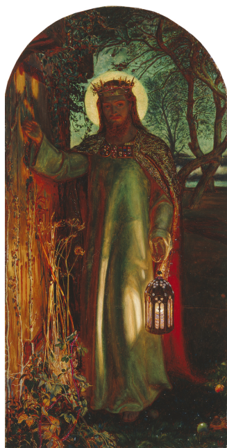
"The Light of the World," William Holman Hunt, 1851-56, Manchester City Art Gallery.